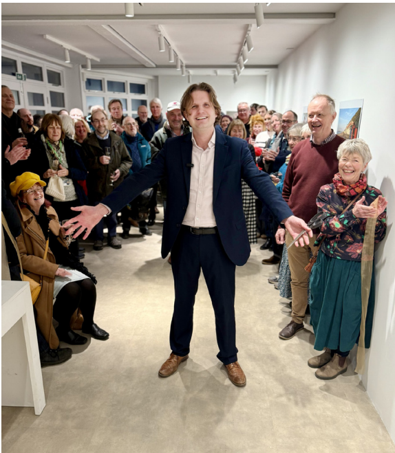
Steff Aquarone MP re-opens Artspace on the Prom