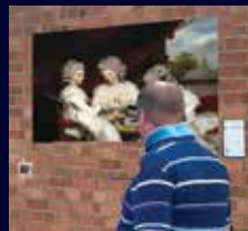
Top: Reverend Robert Walker skating on Duddingston Lake by Sir Henry Raeburn Bottom: The Ladies Waldegrave by Sir Joshua Reynolds

All paintings, pictures and details in this leaflet and in the exhibition are used by kind permission of the National Galleries of Scotland